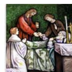
ANointing the Sick