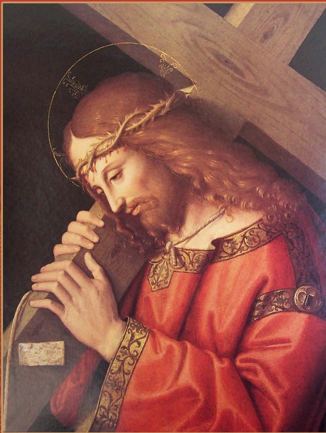
Marco Palmezzano / 1535

Saint Agnes Parish Palm Sunday of the Lord's Passion April 4-5, 2009