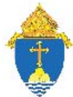
Cardinal Seán P. O'Malley