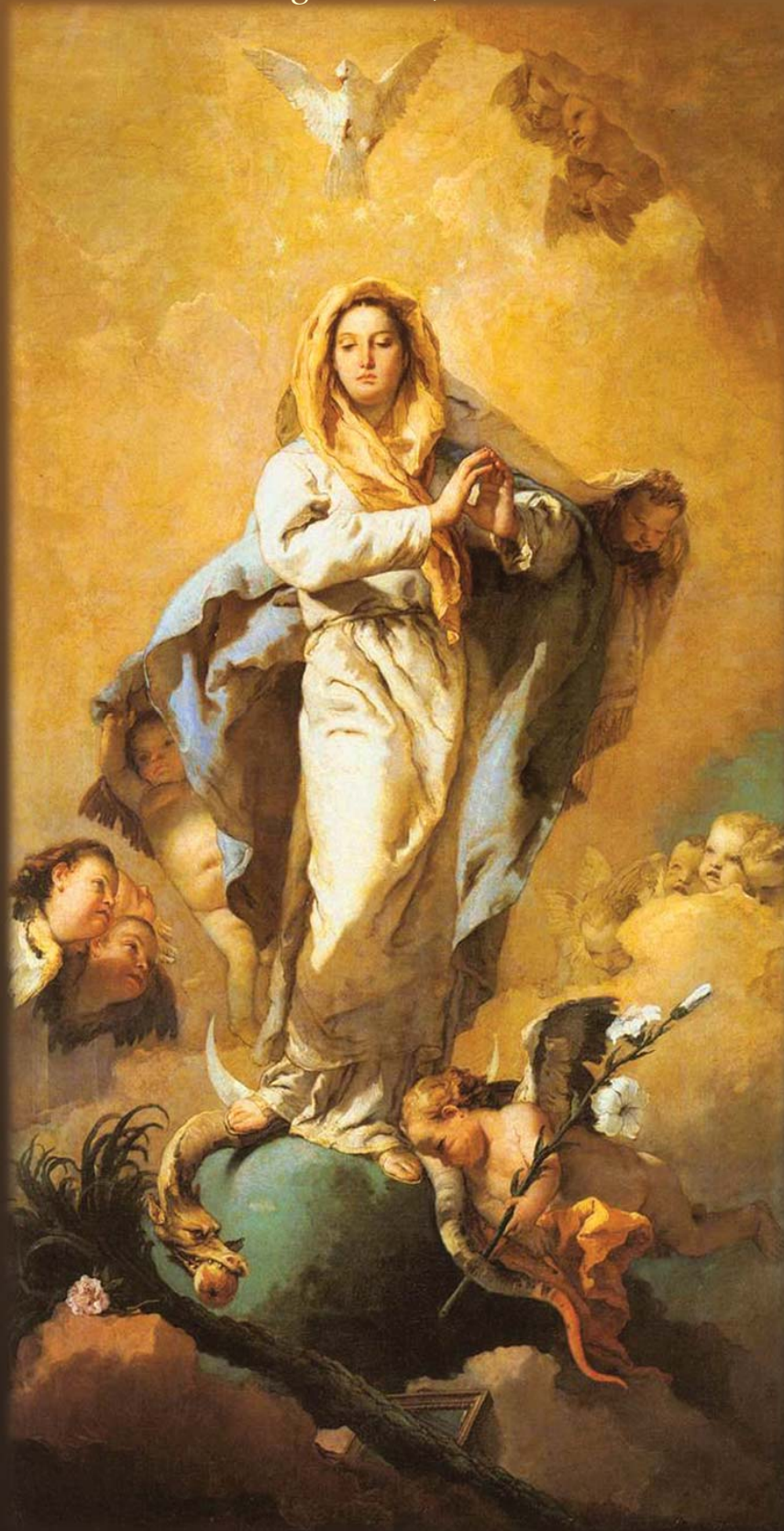
The Miraculous Assumption of Mary